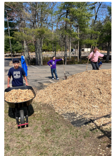
Middle Schoolers recently helped with a service project to spread mulch in our Nature Explore Playspace.